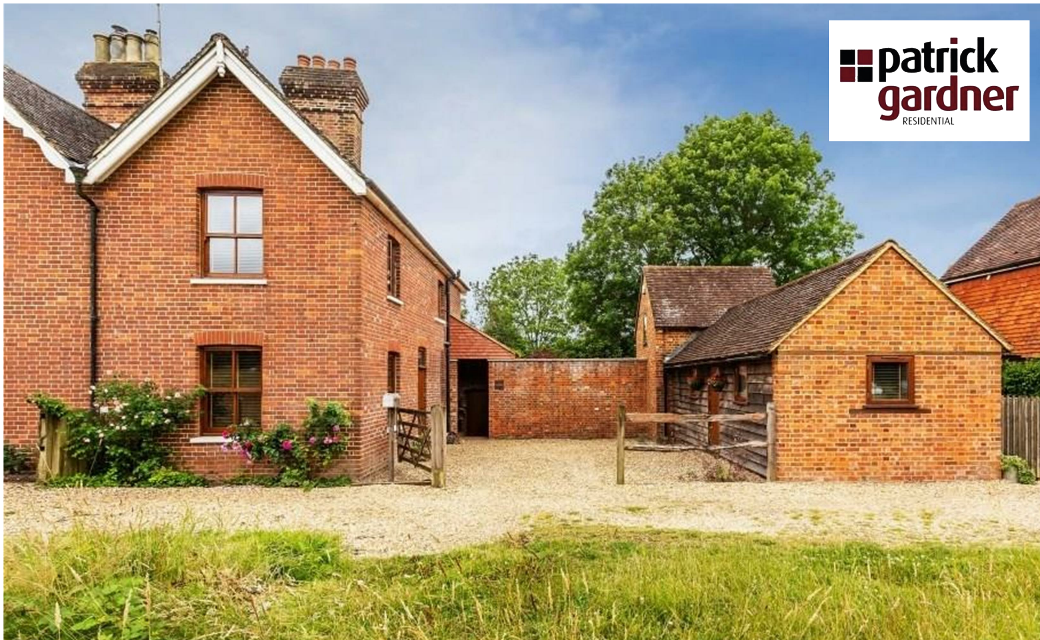
1 Beech Cottages Forest Green, Dorking, Surrey, RH5 5SG